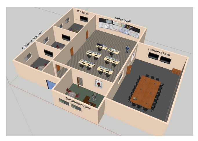
Figure 1. Advanced Outage Control Center Concept

This report documents the results of a benchmarking effort to evaluate the transferability of technologies demonstrated at Idaho National Laboratory and the primary pilot project partner, Palo Verde Nuclear Generating Station. The initial assumption for this pilot project was that NPPs generally do not take advantage of advanced technology to support outage management activities. Several researchers involved in this pilot project have commercial NPP experience and believed that very little technology has been applied towards outage communication and collaboration. To verify that the technology options researched and demonstrated through this pilot project would in fact have broad application for the US commercial nuclear fleet, and to look for additional outage management best practices, LWRS program researchers visited several additional nuclear facilities. Additionally, researchers documented various physical layout aspects of the OCCs currently in use to identify best practice attributes to include in an AOCC concept layout.