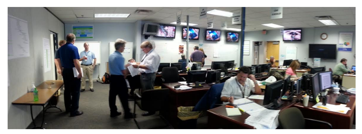
Figure 4. St. Lucie OCC