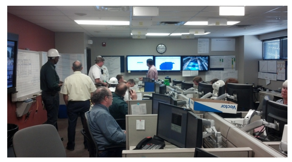
Figure 2. Palo Verde OCC Before