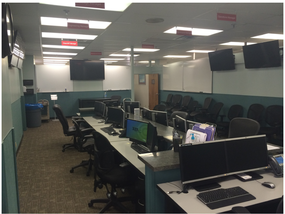
Figure 6. Farley OCC alternate view