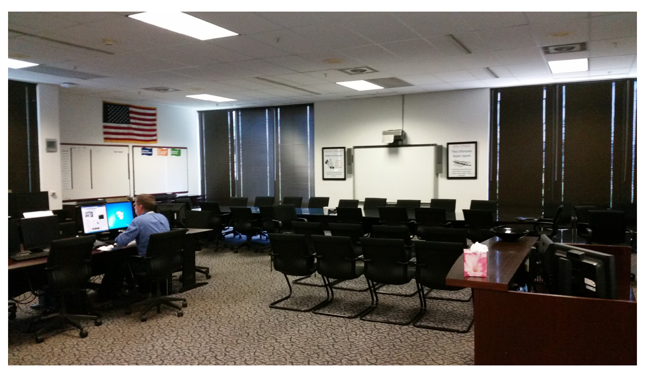
Figure 7. Sequoyah OCC

allow outage managers access to all the OCC displays as they travel around the site and attend meetings outside the OCC. LWRS staff will observe and evaluate their technology implementation during their next refueling outage.