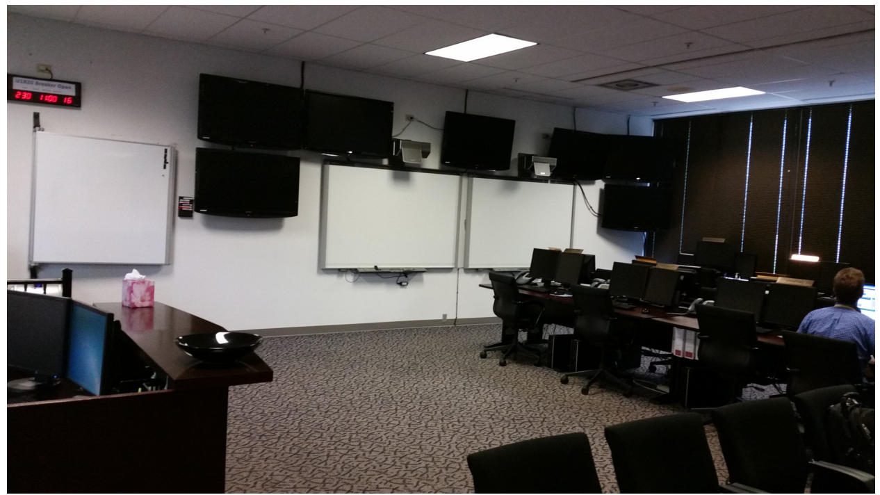
Figure 8. Sequoyah OCC alternate view