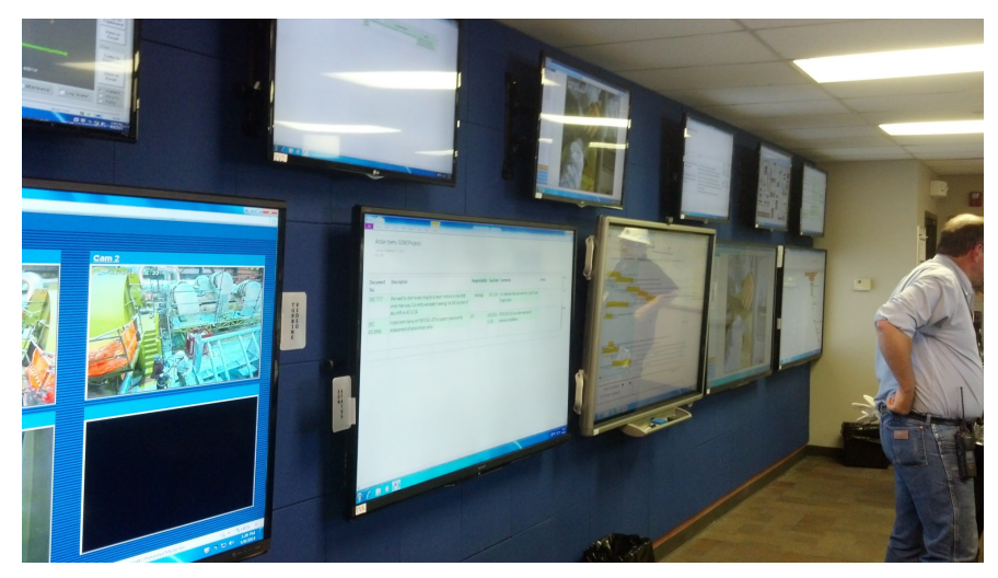
Figure 3. Palo Verde OCC After